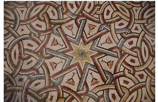
A detail of a geometric pattern in the mosaic of Khirbat al-Mafjar.

research questions about Islamic art, I have charted the development of the mosaic industry in this region through five centuries of craft practice and artistic output (quite a lot more than I first set out to do).