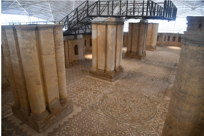
The mosaic pavement of Khirbat al-Mafjar as seen from the viewing platform.

resource in research not only for Islamic art but for Late Antique studies more broadly.