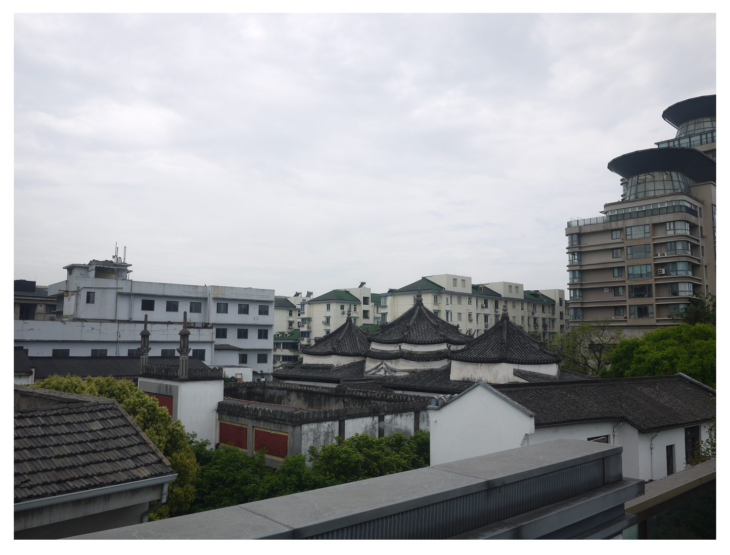
The roof of the Phoenix Mosque's prayer halls seen from a nearby bridge.

and the construction of the new mosque on the outskirts emerged as a successful tactic to literally push Muslim devotional activities to the peripheries and restore secular norms in the urban center.