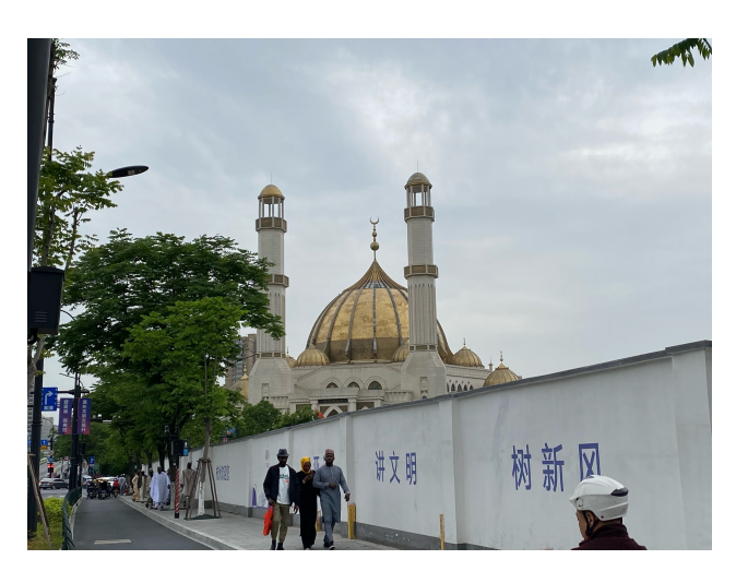
The Hangzhou Mosque seen from inside the building complex and from the street.

mind the Laylat al-Qadr celebration that I attended in 2016 when the Phoenix Mosque was still the primary location for Muslim congregation in Hangzhou. Despite being nestled in a Chinese courtyard, the historical mosque was an organic part of the urban fabric and allowed for more direct engagement with Islamic traditions. This remains true even for local Muslims, as the new mosque, despite offering comfort and grandeur, necessitates a lengthy commute.