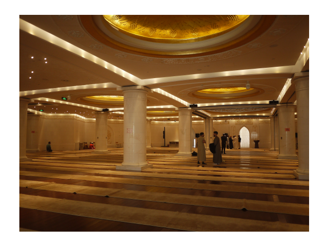
Attendees of the Eid celebration in the Hangzhou Mosque's main prayer hall.

during COVID also facilitated this transition). Stripped of traces of active devotion, the mosque reopened to the public as a cultural heritage site, seamlessly aligning with the Imperial Street's medieval-themed tourist purposes.