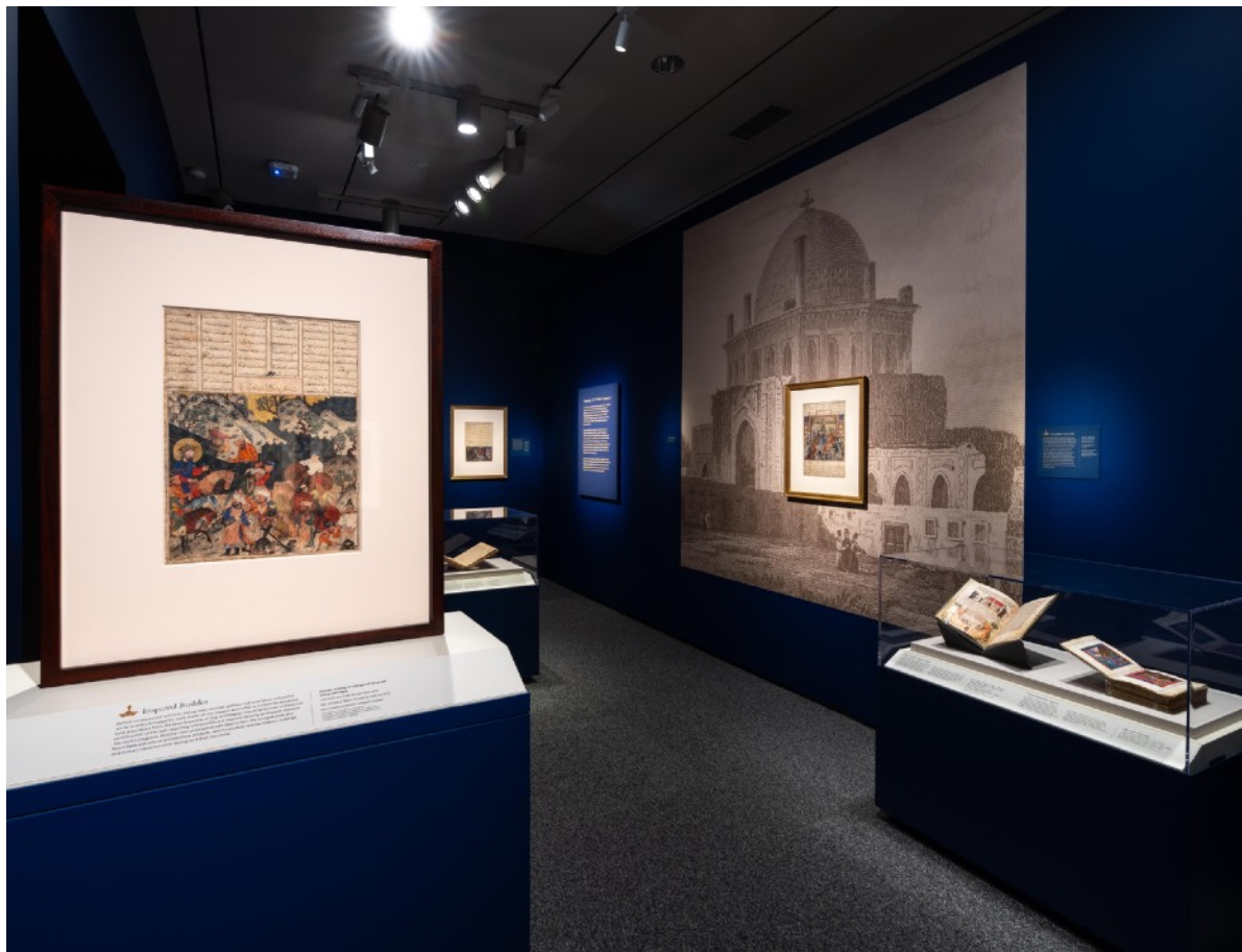
An Epic of Kings: The Great Mongol Shahnama.

This was presented on multiple occasions. For instance, in Bahram Gur killing the dragon , the evil beast adopts the shape of the benevolent Chinese creature featured on a contemporaneous Yuan scroll. In Shah Zav enthroned , we see how depictions of a Buddhist deity and Christ in majesty coalesce. Again here, to understand the creation of the paintings in the Great Mongol Shahnama , you must look at multifarious visual sources together.