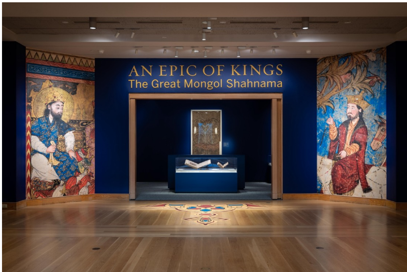
An Epic of Kings: The Great Mongol Shahnama.