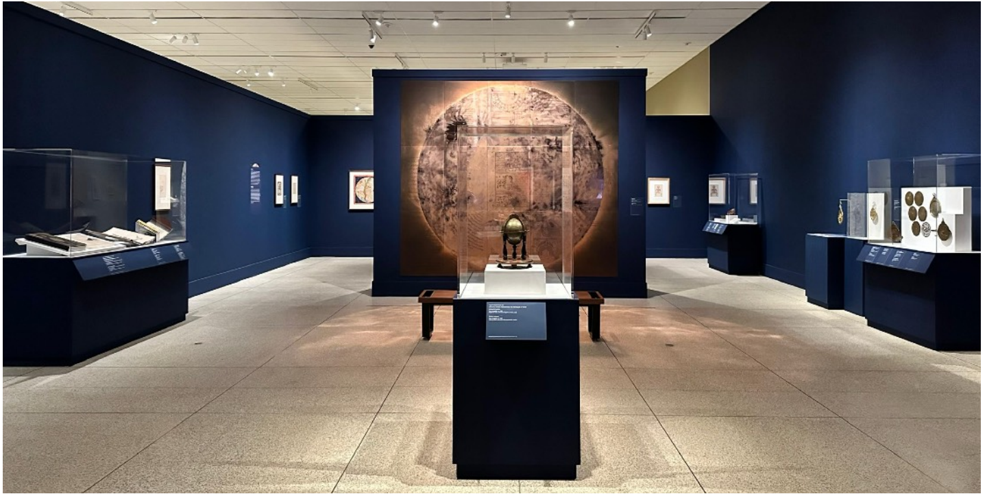
"Wonders of Creation: Art, Science, and Innovation in the Islamic World" at the San Diego Museum of Art.