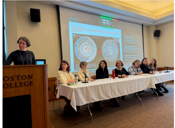
Roundtable on provenance at the 9th Biennial HIAA Symposium

The HIAA Board held a Zoom town hall meeting in early March to answer questions from our members about the new bylaws, after which we asked the membership to vote to adopt this document. The bylaws were adopted on April 11, 2025 by majority vote. We are now in the process of hiring a firm to serve as our registered agents in New York state where we will incorporate, and to help us with filing the paperwork. I am hopeful we will be done with this process before the end of the calendar year, and that in my annual report I can say that we have successfully completed this important task.