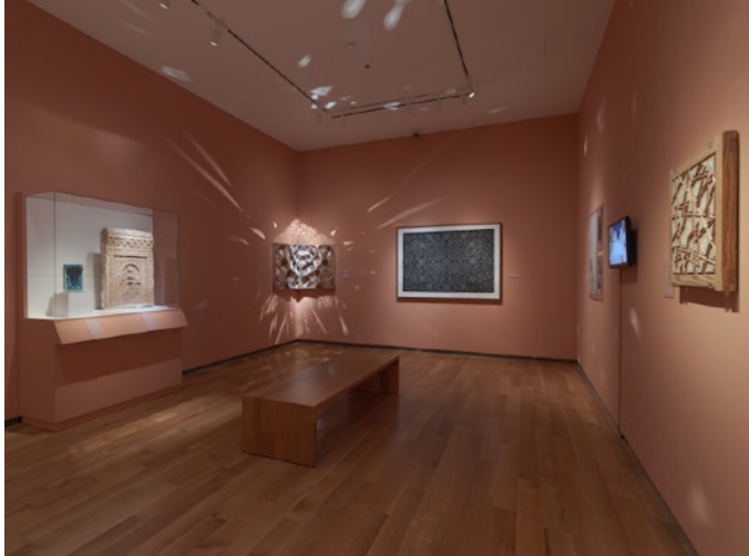
"Wonders of Creation: Art, Science, and Innovation in the Islamic World" at the McMullen Museum of Art at Boston College.

illuminated album folios with poetic verses cut from paper—or on a contemporary work by a Japanese calligrapher featuring Qur'anic verses in mirror-image.