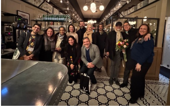
Attendees at the 9th Biennial HIAA Symposium