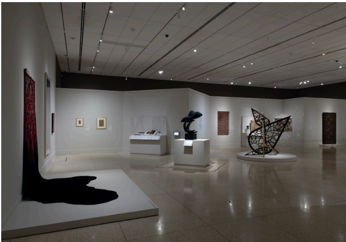
"Wonders of Creation: Art, Science, and Innovation in the Islamic World" at San Diego Museum of Art.

Qazwini writes the text as a cosmography or a description of the universe. The text has a popular character to it, containing stories from oral tradition or folklore, bringing in verses from the Qur'an, and citing developments made by Islamic scientists and philosophers