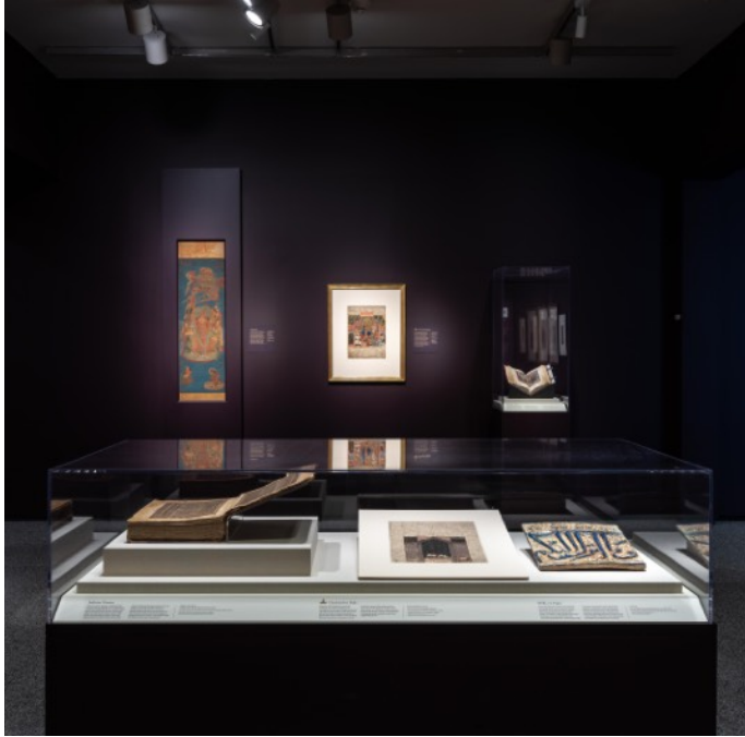
An Epic of Kings: The Great Mongol Shahnama.