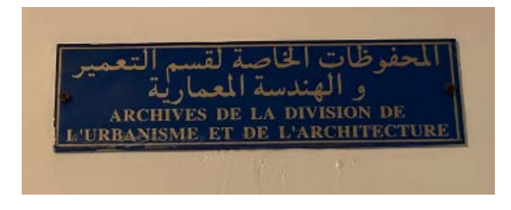
One of the main archives that the author extensively worked with, located in the City Hall annex in Agadir, Morocco.

Concretely, my project begins by focusing on the Agadir reconstruction master plans and the ensemble of buildings of the new city center designed by Mourad Ben Embarek,