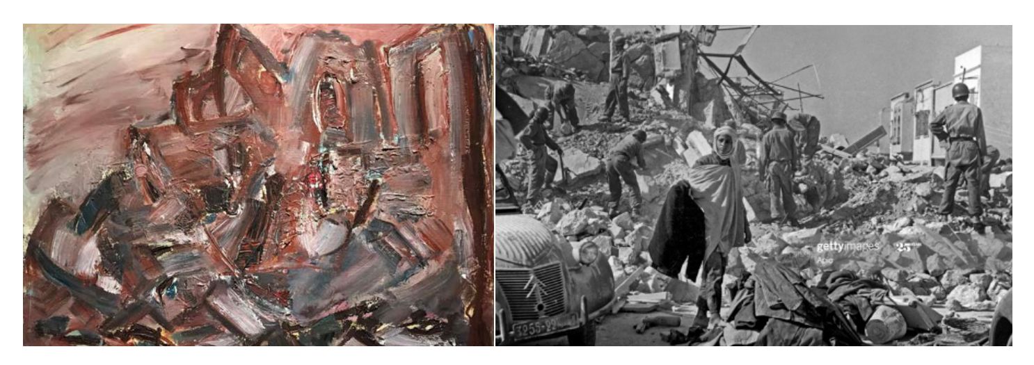
André Elbaz, Le tremblement de terre d'Agadir (The Agadir Earthquake), 1960, oil on canvas. Private Collection of André Elbaz.