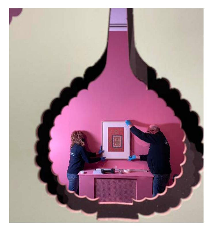
Figure 2. Installing Shaykh 'Abbasi's portrait of Shah Sulayman (r. 1668–1694) at the Chester Beatty exhibition Meeting in Isfahan. Dublin, 2022.

For those who cannot travel to Dublin before the exhibition closes in August 2022, there is an interactive 3-D model of the space online that is well worth a few hours of your time. The manuscripts on display were digitized largely for the exhibition, and a link to each object on the Chester Beatty website is provided in the virtual